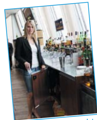
Use on cupboards, cabinets & lockers